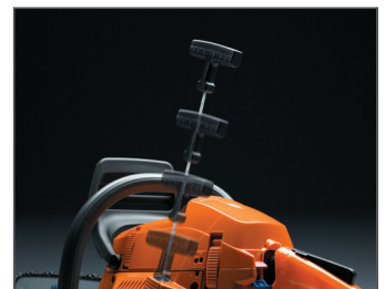
SMART START® The engine and starter have been designed so the machine starts quickly with minimum effort.