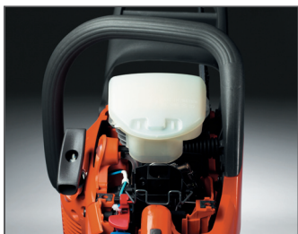
QUICK-RELEASE AIR FILTER Facilitates cleaning and replacement of the air filter.

Husqvarna 359, the robust mid-range professional saw for various use. With raw strength in a wide range of speeds, with a slim and easy to handle body and low vibration levels, the 359 is a truly versatile saw for the widest variety of tasks. A reliable and effective tool for the most demanding professional needs.