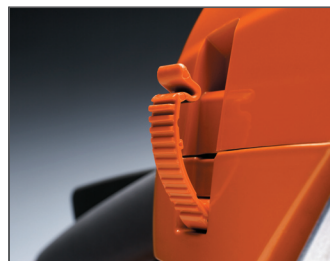
SNAP-LOCK CYLINDER COVER Saves time when changing spark plugs and cleaning.